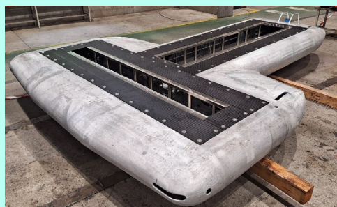
Front top image from NOAA Ocean Exploration. Data images from Ifremer. Left, Kongsberg Discovery custom designed portable gondola in galvanized steel.